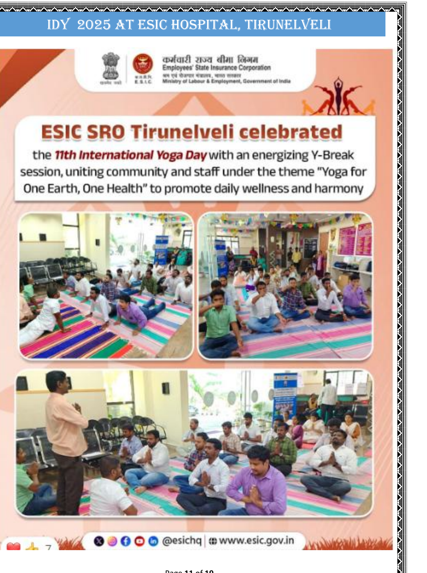
Page 11 of 19

the 11th International Yoga Day with an energizing Y-Break session, uniting community and staff under the theme "Yoga for One Earth, One Health" to promote daily wellness and harmony