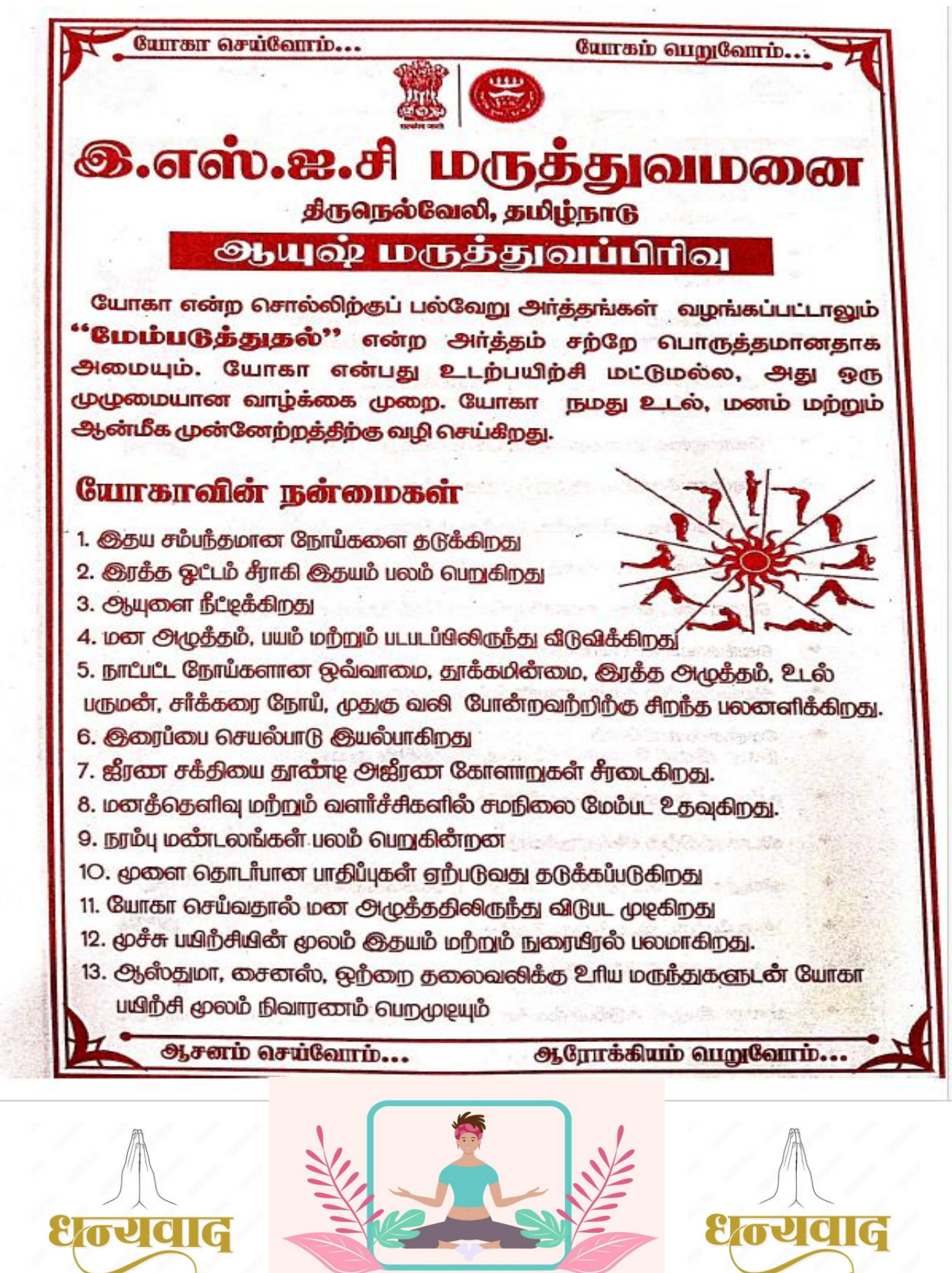
Page 19 of 19